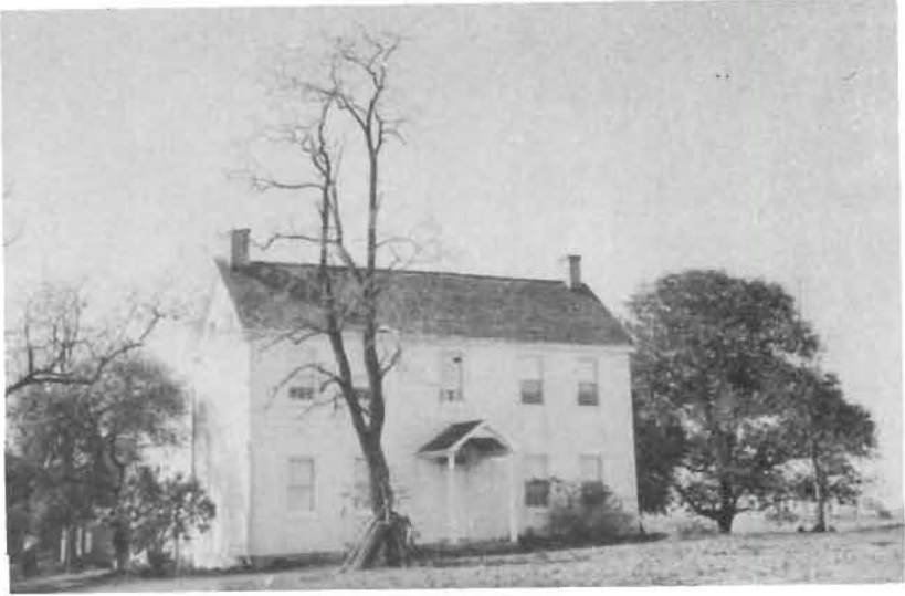
Zachariah Clagett Magruder Home Monrovia, Maryland