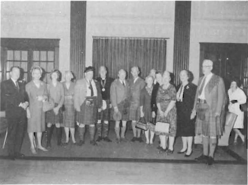
Waiting in Lobby