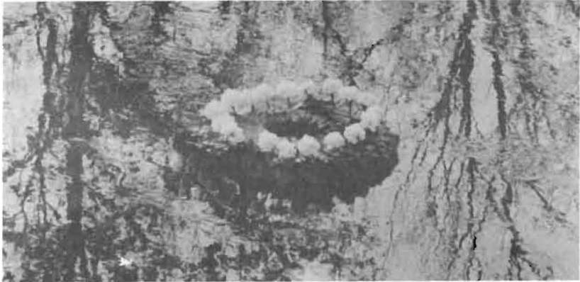
Memorial Wreath on Antietam Waters