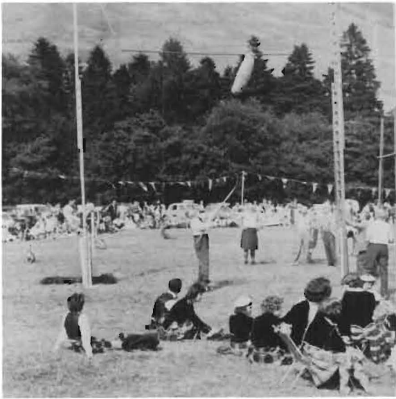
The Perthshire Advertiser