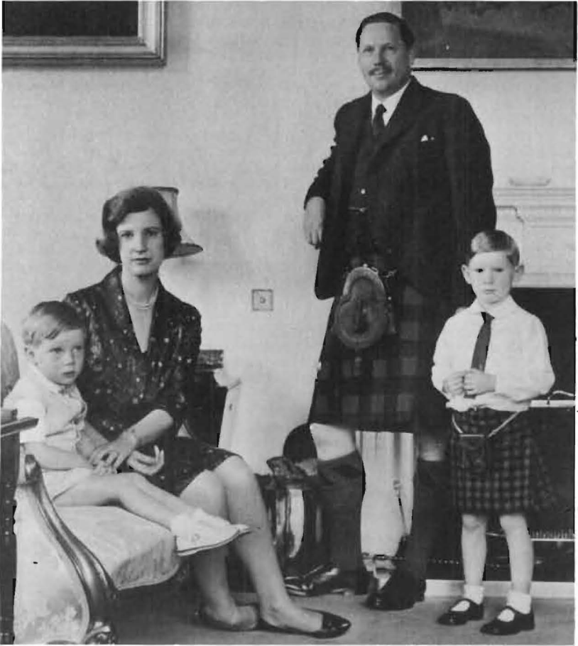
Dundee Courier & Advertiser