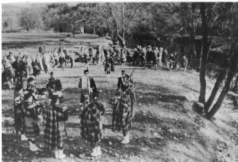
Ceremony at Burnside Bridge