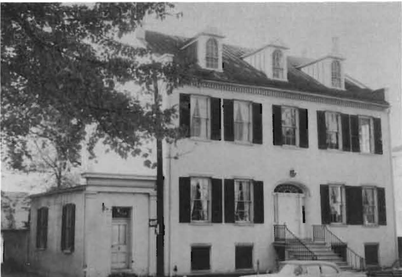
Frederick County Historical Society Frederick, Maryland

Historical research, such as is exemplified in the article preceding and in the "Wills, Accounts and Indentures" following, may be done in Frederick in this lovely building.