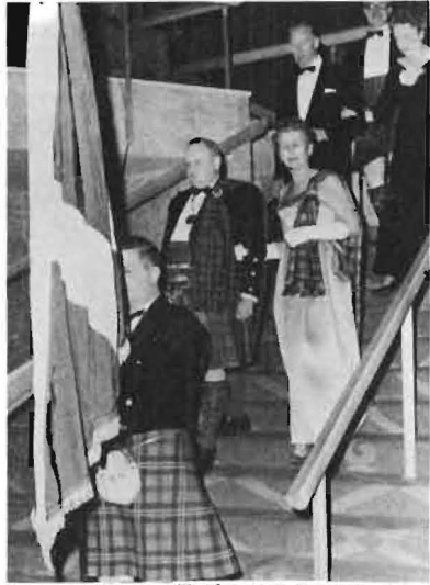
Washington Evening Star