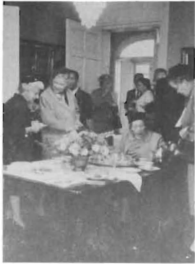
Friday Afternoon Tea