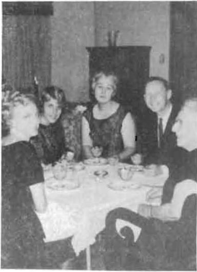
Group at Council Dinner