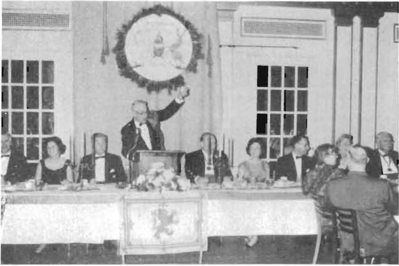
Head Table at Banquet Proposing a Toast to Our Chief