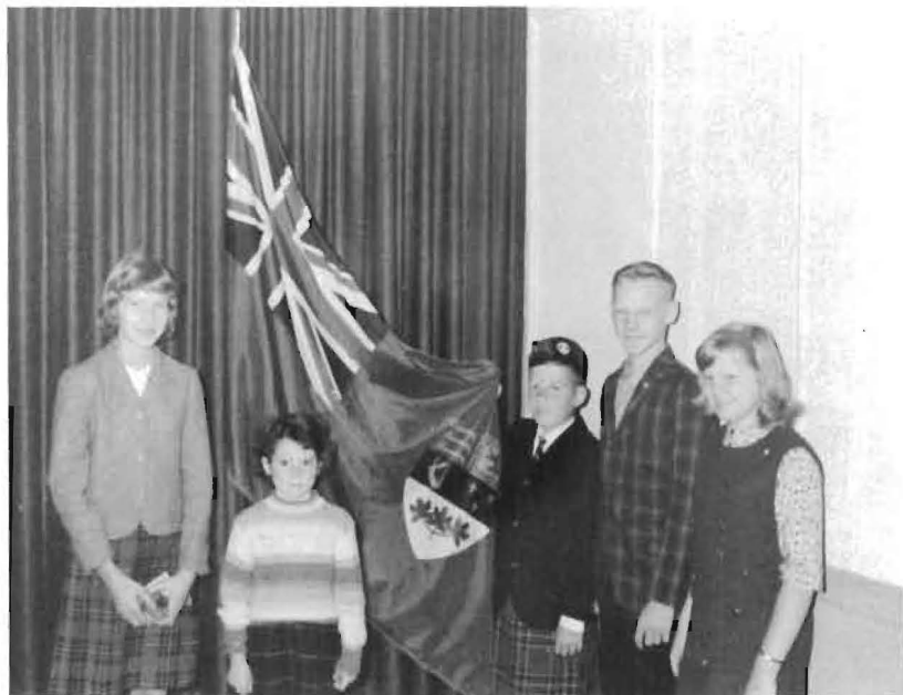
Younger Generation Attending Gathering (Names in Minutes)

There being no further business the meeting was adjourned at 11:18 A.M.