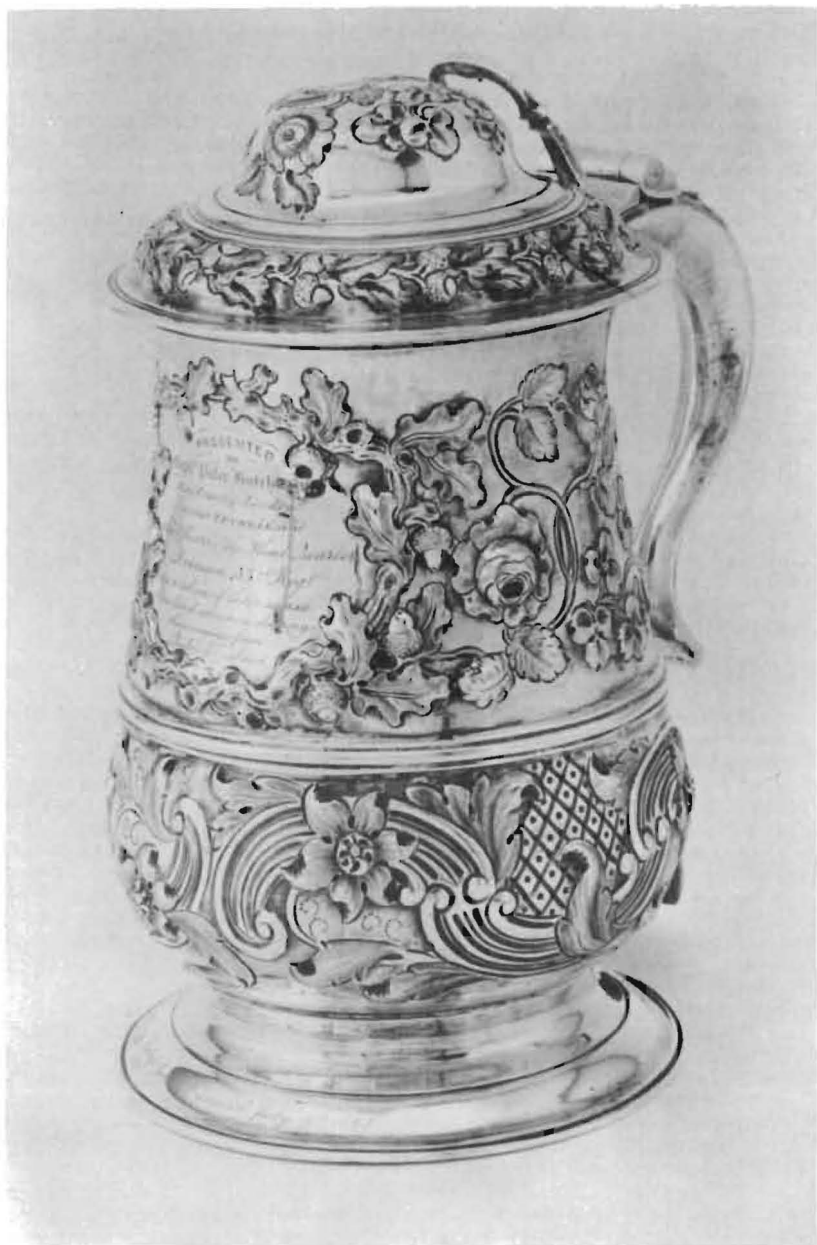
Old English Silver Tankard