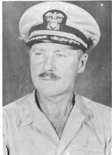
Ranking Deputy Chieftain