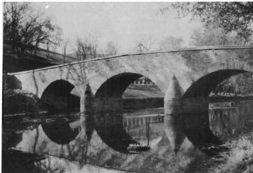
Burnside Bridge Antietam National Battlefield