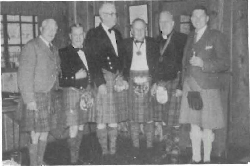
Kilted Council Members