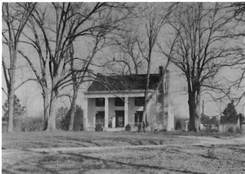
Ravenswood Richmond, Virginia