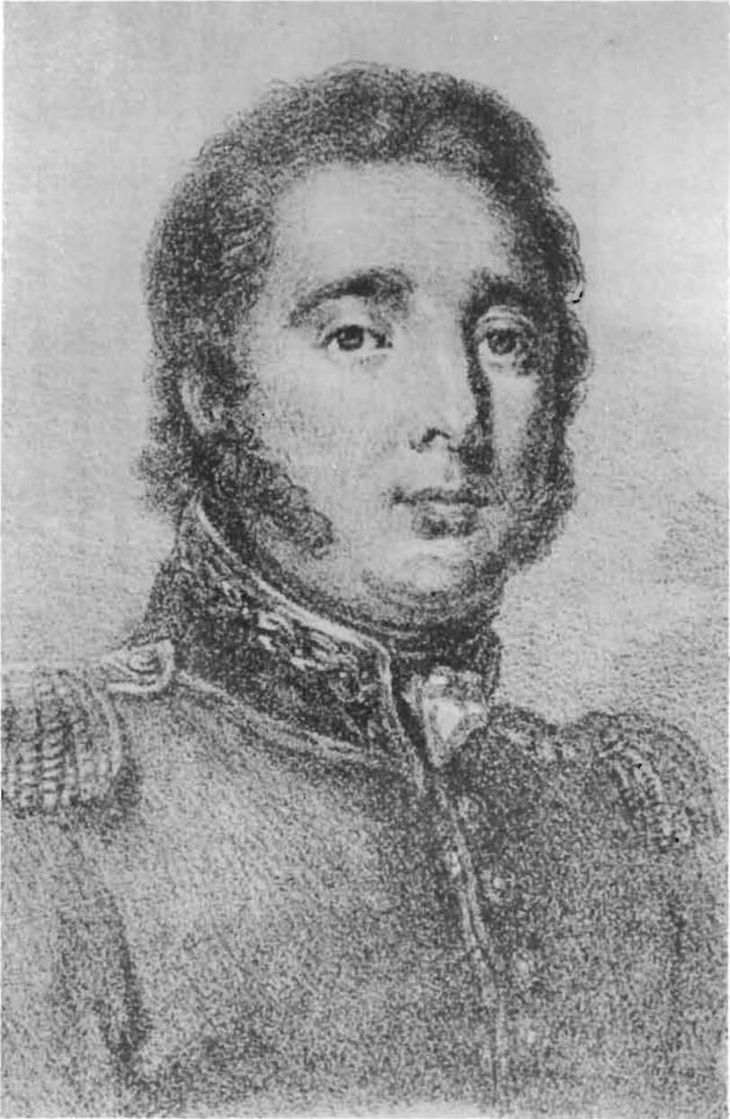
General Gregor MacGregor