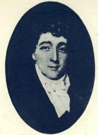
Francis Scott Key 1780-1845

The Home of Mary Young Pickersgill, 1776-1857, where she made the flag which after 24 hours bombardment of Fort McHenry proclaimed deliverance for Baltimore, and a century of peace and prosperity for the Nation.