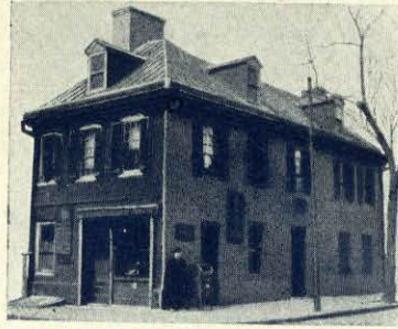
The Baltimore Flag House, 1793-1928

Victory Flag of Fort McHenry, 29x36 ft., which inspired Key's Song, Sept. 14, 1814. Restored 1914, and on exhibition at the U. S. National Museum, Washington.