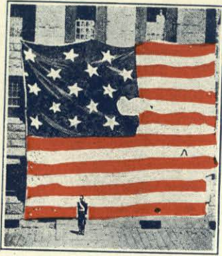
"The Star-Spangled Banner"

Victory Flag of Fort McHenry, 29x36 ft., which inspired Key's Song, Sept. 14, 1814. Restored 1914, and on exhibition at the U. S. National Museum, Washington.