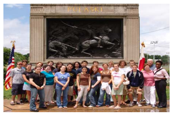
The American participants tour Polonia before beginning the trip.