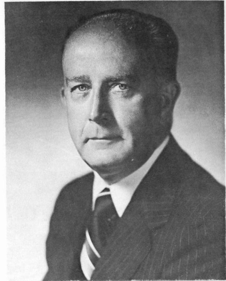
WILLIAM DONALD SCHAEFER MAYOR OF BALTIMORE CITY

As Mayor of the City of Baltimore and on behalf of all her citizens, I am pleased to extend my warmest greetings to all citizens of Polish descent.