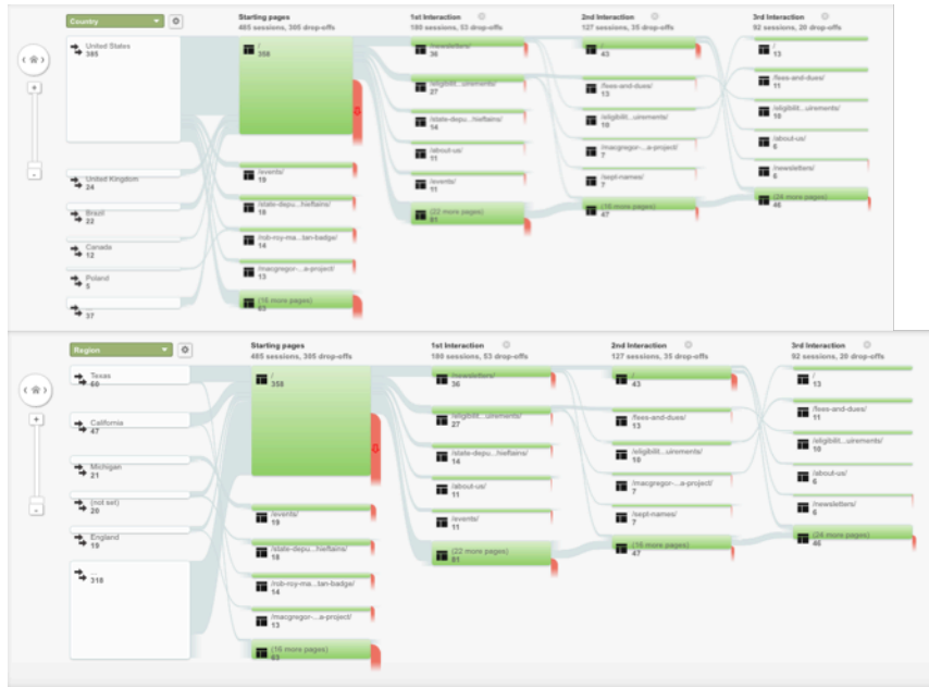
Page Flow by Origin of Visit USA