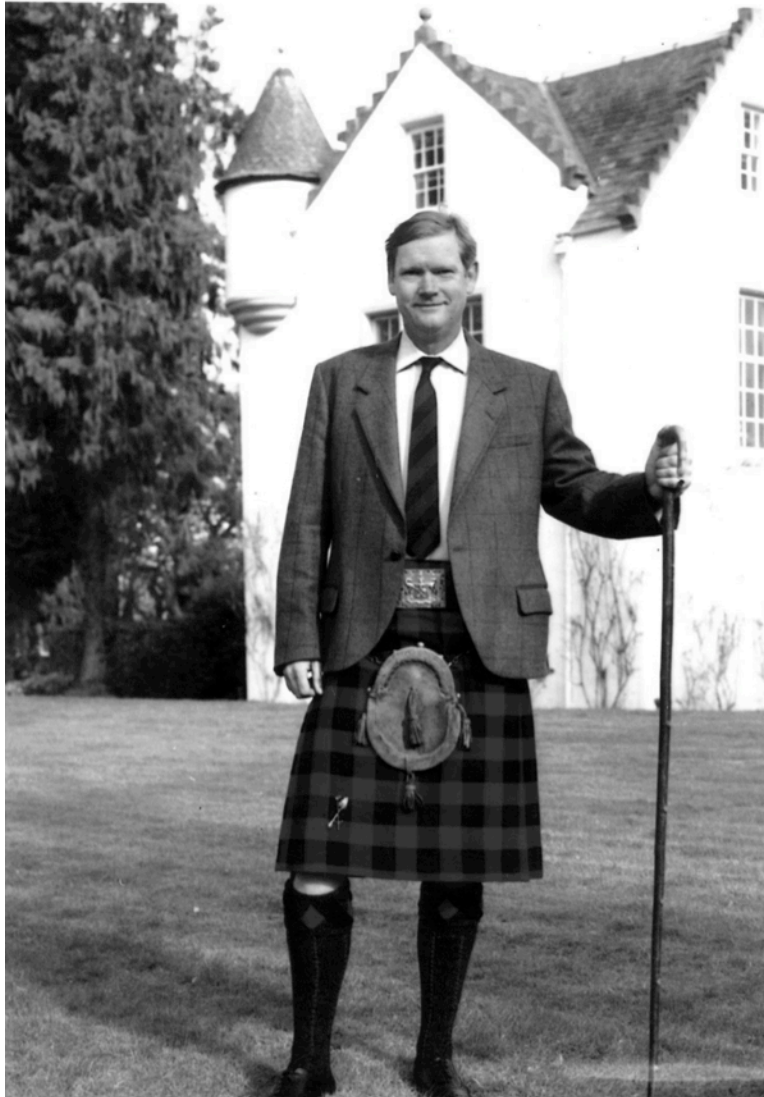
Sir Malcolm MacGregor of MacGregor