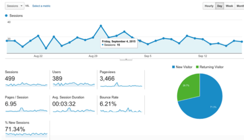
Website Pages Visited