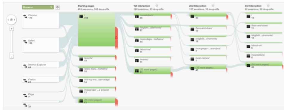
Page Flow by Browser