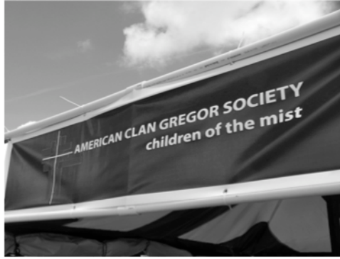
Children of the Mist Banner

We are delighted to send this report from the Grandfather Mountain Highland Games in Linville, North Carolina, the “Balcony of the Blue Ridge.”.