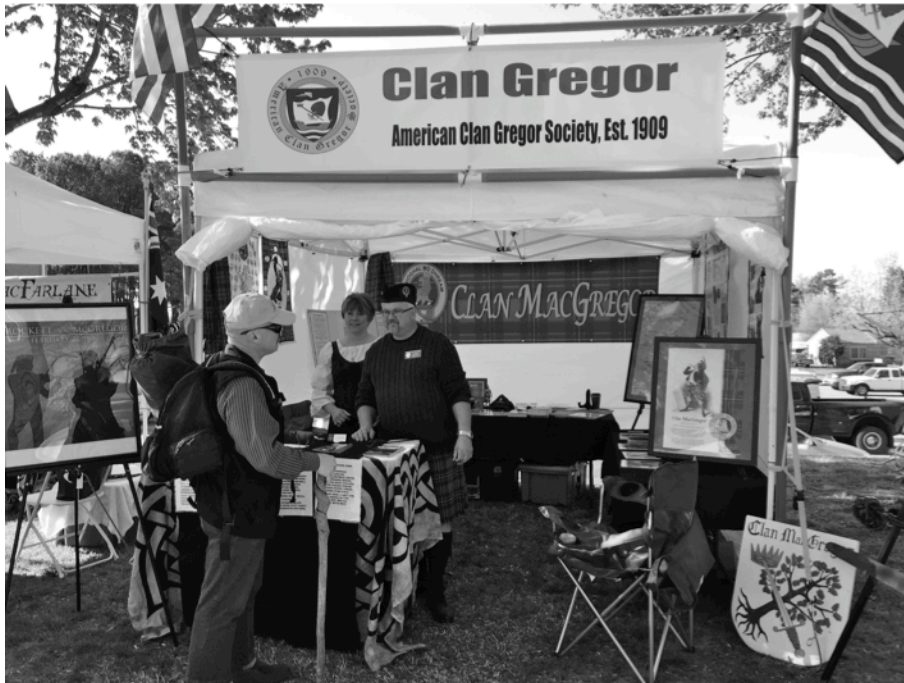
Prize winning ACGS tent at Arkansas Highland Games