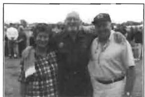
Sarasota, FL Games