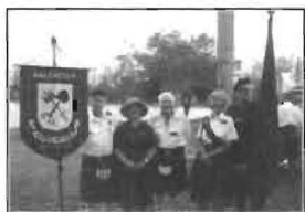
Some ACGS members that marched in the Parade.