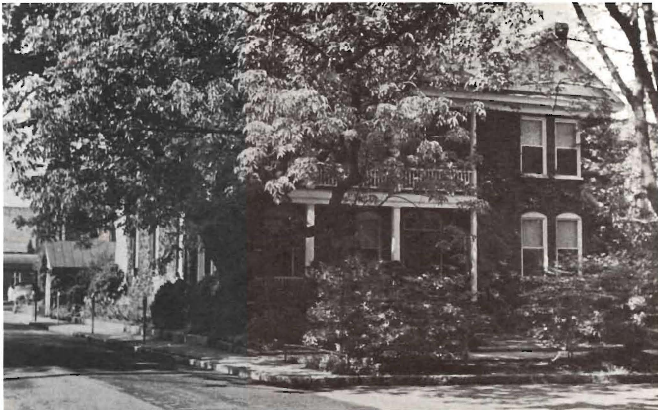
Birthplace of the American Clan Gregor Society, Charlottesville, Virginia