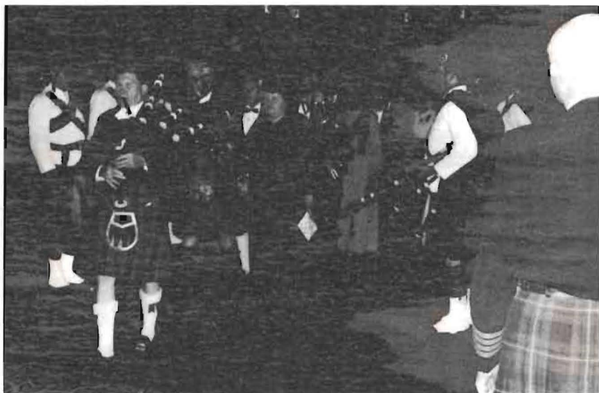
Council Members and Guests "Marching" to 74th Banquet