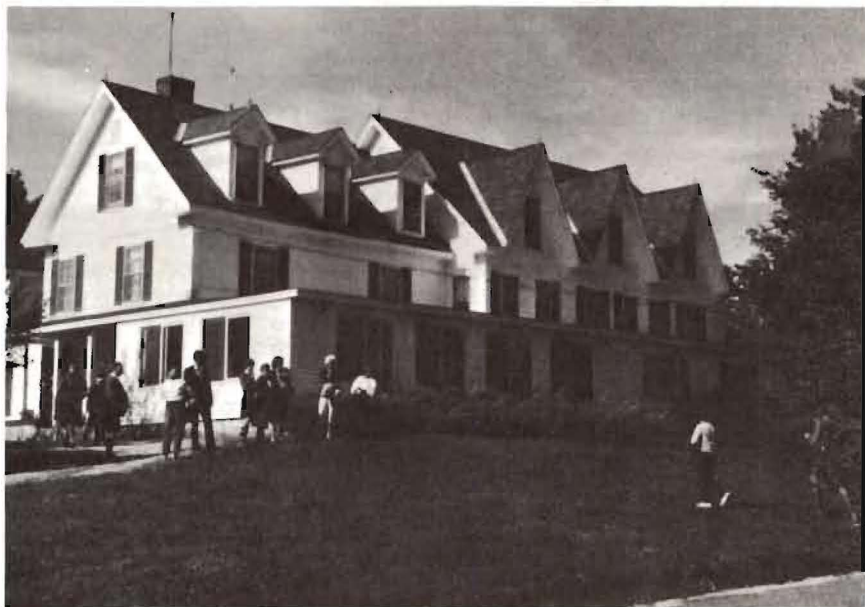
Pleasant Lake Inn, New Hampshire

Another drive through rolling and colorful country took our three buses to an old substantial building named Pleasant Lake Inn for lunch. Some of us dined on the broad, glassed-in porch where we were afforded a magnificent view of the lake with color-splashed mountains, rising to a blue and white flecked sky. Yes, MacGregor Gathering weather was with us all day.