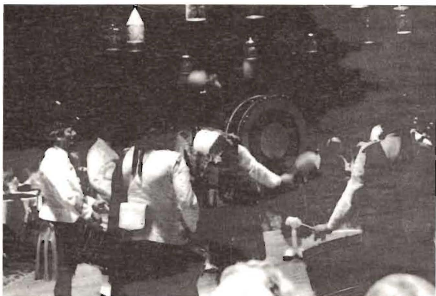
The Pipe Band