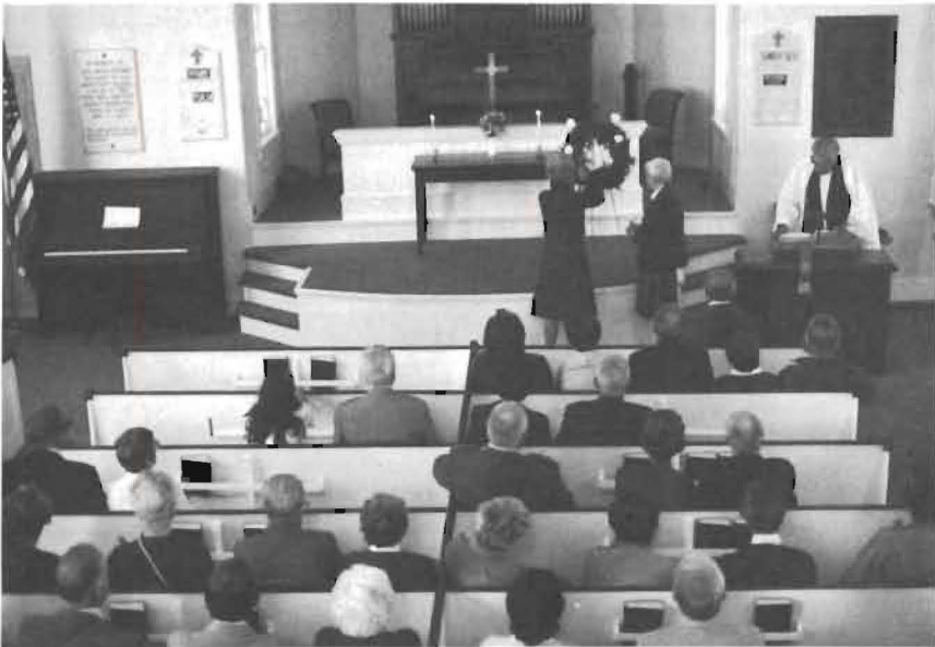
Memorial Service for our departed clansmen in the church at Alexandria, New Hampshire.