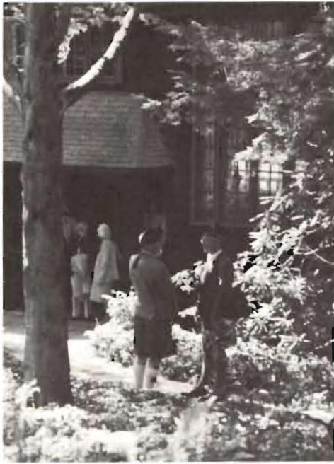
Woodhidden, Lake Sunapee, N.H.