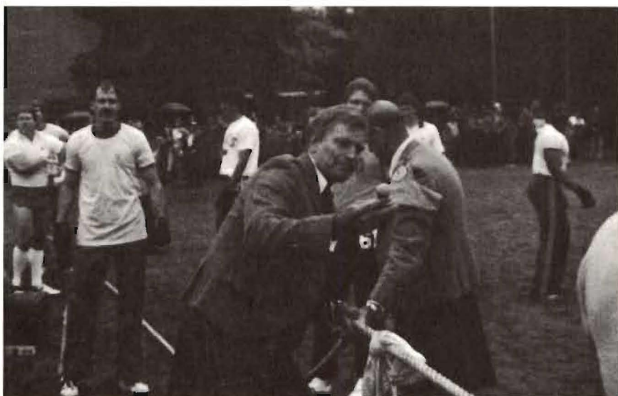
Charlton Heston, Honored Guest, Central Park, Highland Games, 1983.