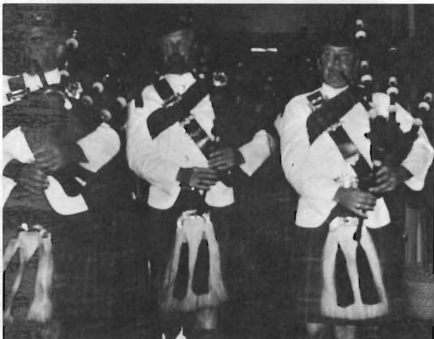
The Pipe Band