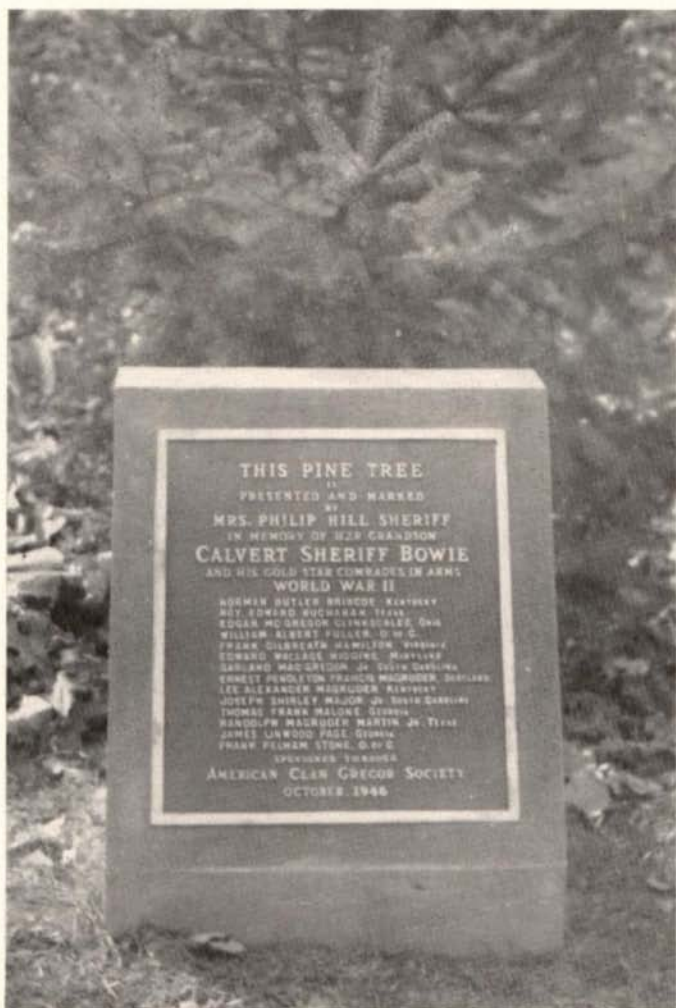
BRONZE TABLET DEDICATED TO GOLD STAR MEMBERS OF THE HONOR ROLL