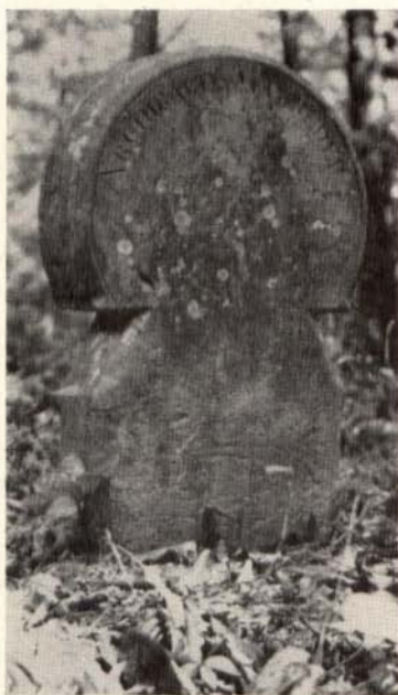
ARCHIBALD MAGRUDER born April 11, 1751 died July 1, 1842